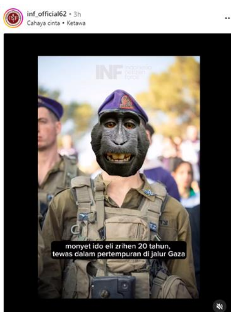
FIGURE 1. Pro-Palestinian post

A unique pattern of language in the existing posts described the sender's emotions. In Psycholinguistics, as previously described, the language produced is influenced by the psychological condition of the speaker. These pro-Palestinian posts tended to describe psychological conditions in the form of angry emotions. This is in line with Holmes' (1992, p. 2) statement that in fact language does not only carry out its 'duty' as a conveyor of information, but furthermore acts as a conveyor of the emotions of its users. The linguistic phenomena that appear indicated the unwillingness towards oppression performed by Israel as a country that always promotes self-defence against the Hamas movement which is labelled a terrorist. This pro-Palestinian netizen does not even hesitate to say harsh words on pro-Israel accounts. Even Islamic religious leaders support such action and state that cursing criminals is a legitimate thing to do, as seen in the following example which equates IDF soldiers with monkeys.