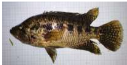
Figure 1. Marsela Fish ( P. managuensis )

Species: Parachomis managuensis (Gunther, 1867)