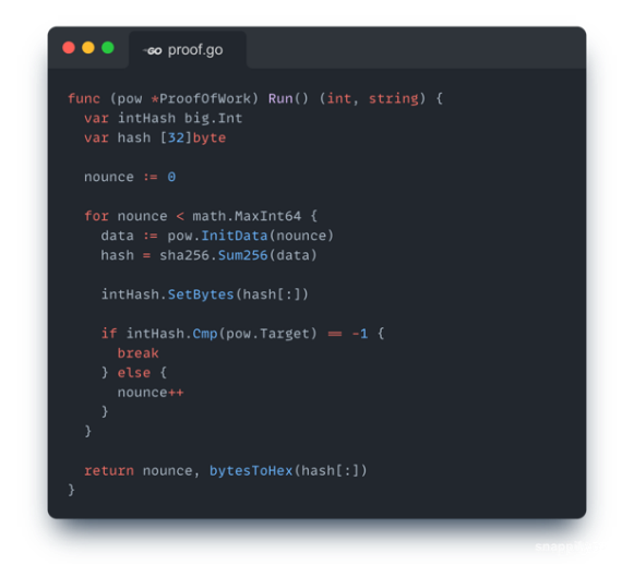
Figure 5. Run Method

Run method of the pow instance serves to hash the byte slice data that has been combined through the initData method of the pow instance and validate whether the hash of the new block is less than the target. If true, it is considered valid; otherwise, if false, it means it is not valid. In such cases, the nonce is incremented, and the process repeats with hashing and validation until a valid node is found. The Run method can be seen in Figure 5.