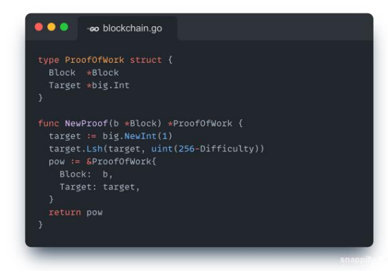
Figure 3. NewProof Function

NewProof is a constructor method to create a consensus instance, in this case is the main logic of the ProofOfWork consensus algorithm. The purpose is to determine the target, which is the value that entities must achieve to validate a block, typically in binary units [17], [18]. In this function, an instance of the target is created using the big.Int data type, the Lsh method is employed to shift bits from the specified value, an instance of pow is created from the ProofOfWork struct, and the pow instance is returned. The NewProof Function can be seen in Figure 3.