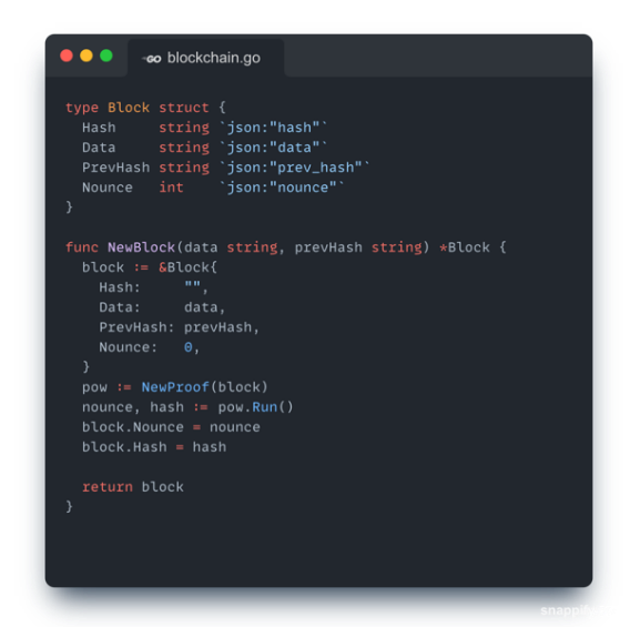
Figure 2. NewBlock Function

NewProof is a constructor method to create a consensus instance, in this case is the main logic of the ProofOfWork consensus algorithm. The purpose is to determine the target, which is the value that entities must achieve to validate a block, typically in binary units [17], [18]. In this function, an instance of the target is created using the big.Int data type, the Lsh method is employed to shift bits from the specified value, an instance of pow is created from the ProofOfWork struct, and the pow instance is returned. The NewProof Function can be seen in Figure 3.