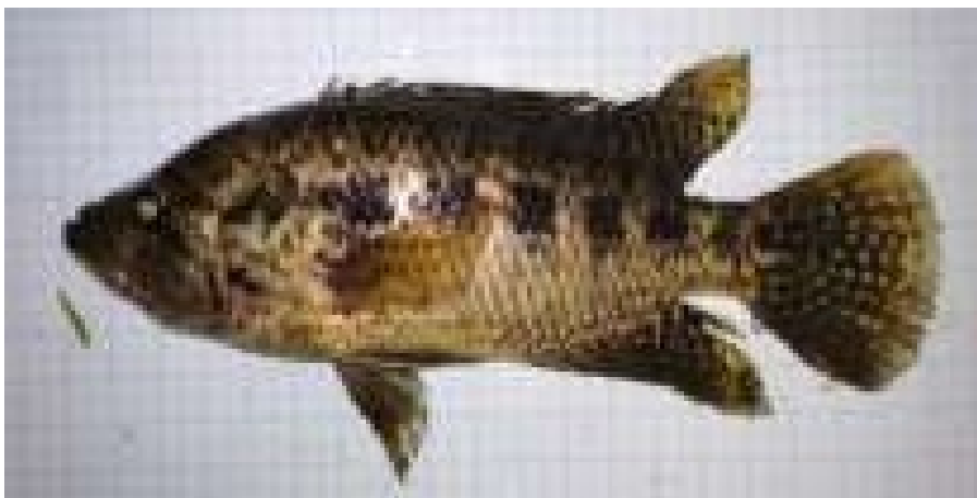
Figure 1. Marsela Fish ( P. managuensis )

The classification of Marsella Fish ( P. managuensis ) according to Gunther (1867) in Agasen et al. , (2006) namely: Phylum: Chordata Subfilum: Vertebrates, Class: Actinopterygii Order: Perciformes Family: Cichlidae Genus: Parachomis (Agassiz, 1859) Species: Parachomis managuensis (Gunther, 1867).