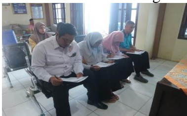
Figure 5. Pretest Filling Related to Website and E-Government

This exercise was divided into three sessions, and the first was the work on Pretest questions related to the Website and E-Government, and the staff of the information media section was given a pretest filling questionnaire to find out the initial ability to introduce the Website and its benefits. In the Pretest session, from 4 participants and five pretest questions (Figure 5). Each of them only