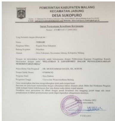
Figure 3. Willingness as A Partner