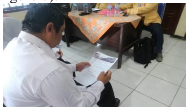
Figure 7. Implementation of Post-Test

The third session, which is the last session, is post-test work in order to find out the results of this service activity. This activity is very interesting because the IT team from Sukopuro Village gained new experience and skills in the use of Information technology media (Figure 7).