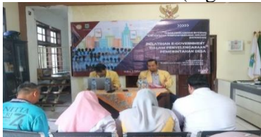
Figure 4. Opening of Community Service "E-Government Training"

This activity will be held on Wednesday, February 1, 2023, at the Sukopuro Village Hall. It is clear that these actions have a beneficial impact and generates positive responses from the village because it increases knowledge and ability to organize the web and make Google Forms a means of accommodating community participation in village development in the context of implementing the Sukopuro Village Government E-Government (Figure 4).