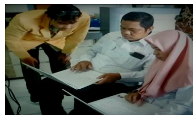
Figure 6. Implementation of Community Service "E-Government Training"

In carrying out this activity, the Village experienced difficulties in accessing and filling in the Website and did not know the procedures for utilizing technology and the