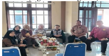
Figure 2. Coordination and Establishing Agreements

The partners who are part of this series of service activities are part of the informatics system in Sukopuro Village; before this activity was carried out, we a team of lecturers and students of Wisnuwardhana University Malang from the Faculty of Law and the Faculty of Teacher Training and Education coordinated with the Sukopuro Village Government (Figure 2 and Figure 3).