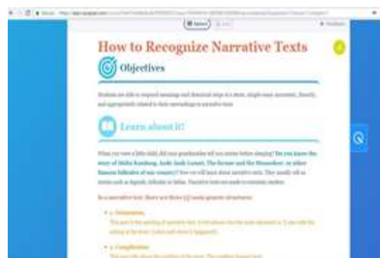
Figure 1. The Generic Structure

Teachers can make use of existing teaching materials that have been provided in the database or develop their own. One of the advantages of Quipper School among other web-based Learning Method System (LMS) is that it has provided teaching materials in the web that can be used by teachers instantly. It can be seen from the picture below;