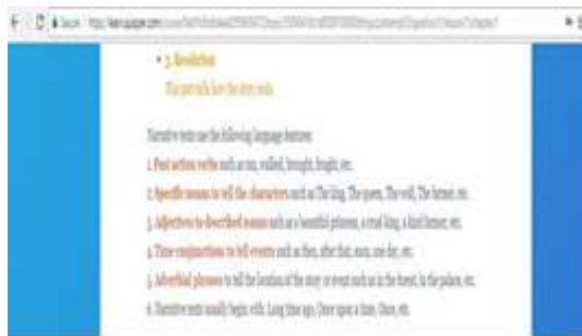
Figure 3. Material Sample of Narrative Text in Quipper School for Student