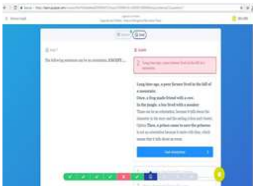
Figure 5. The Question and the Explanation if the Student Answers Wrongly