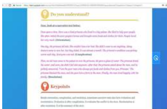
Figure 1-3 are a sample of teaching material that has been provided by the database. It is intended for students of the ninth graders of junior high school. It is about understanding narrative text: Legends and Fables.