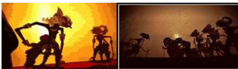
Picture 2.5 Shadow Puppet

Shadow puppets is a kind of puppet that is how to play it by showing the motion of the shadows of the doll. In Indonesia, especially in Java known as "Wayang kulit". But for school purposes, this kind of wayang felt less effective, because to play this doll needed a dark/closed room. And also needed a lamp to make the shadow of the screen.