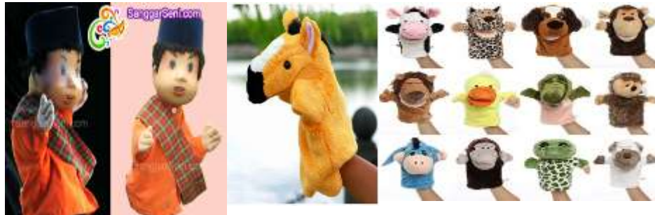
Picture 2.2 Hand Puppet

finger to move the head of the doll, while the thumb, and other fingers to move the hand. In Indonesia the use of hand puppets as a medium of education/learning in schools has been implemented, even used outside the school on TVRI broadcast with the movie series "Si Unyil"