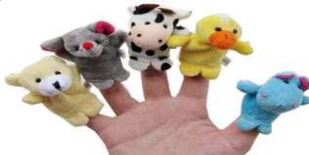
Picture 2.1 Finger Puppet

This doll is made of simple tools such as a bottle cap, a Ping-Pong ball, a small bamboo that can be used as a doll's head. As the name, this doll is played using fingers. A doll's head is placed at our fingertips. It can also be made from a kind of gloves, where at the fingertips of the glove has been shaped doll's head and thus we just play it.