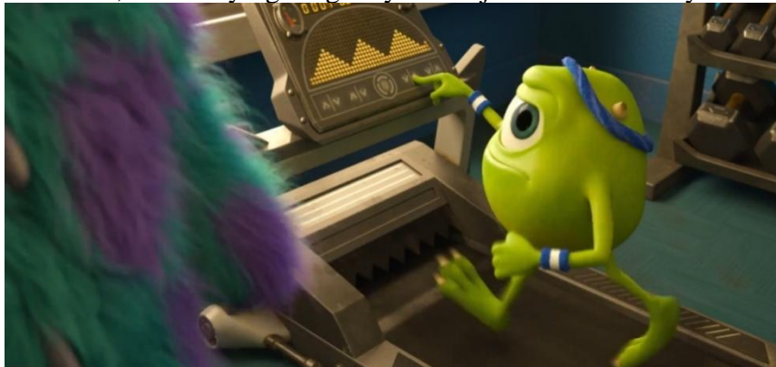
Mike speeds up on the treadmills.

Mike always keeps his spirit on. Since he was a little kid, he has had a spirit to become a scarer. After he got to enter the monster university, he study diligently because he just was so passionate to become a scarer. He always keeps spirit on by learning anything, trying to do all activities that support his personality to become a scarer, and studying diligently all subject in scarer study.