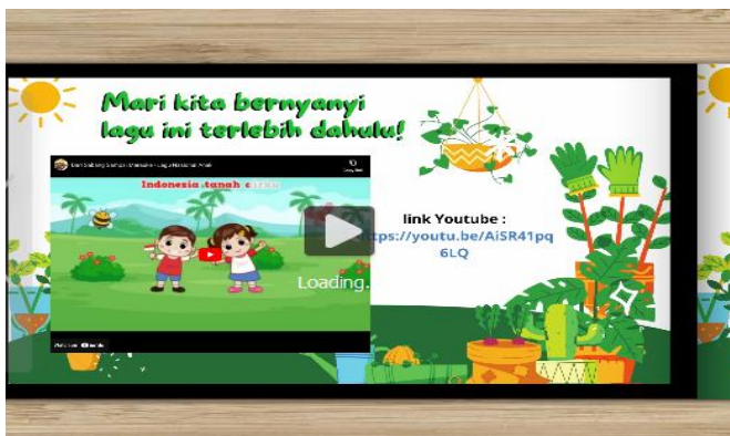
Figure 3. Display of E-module equipped with interactive learning videos