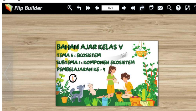
Figure 2. E-Module design process with Flip PDF Professional

The material chosen for the development of this e-module is an introduction to tools in wood practices according to the class V syllabus for ecosystem material. The material presented is in the form of metamorphosis, symbiosis, food chain to the life cycle of animals. The material was chosen for media development because based on the results of the questionnaire given to students, they needed time to be able to study independently not only in class but to be able to study independently anywhere.