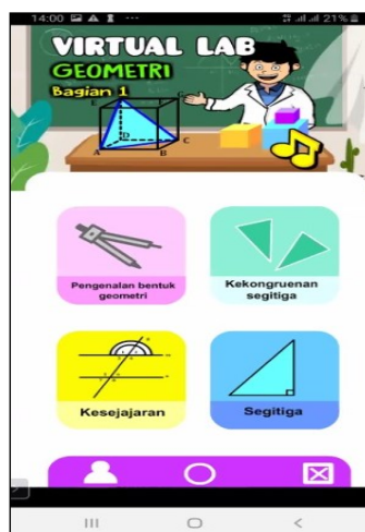
Figure 2. Design virtual laboratory geometry

In making virtual laboratory products, geometry courses have been created in a team by the UT research team and assisted by IT experts outside UT so that there is good collaboration with the UT research team to create a material and design framework that is expected in making a virtual laboratory, then executed by IT experts who competent in their field, after the virtual laboratory design is finished for about 2 months, the product is continued in the third stage, namely development.