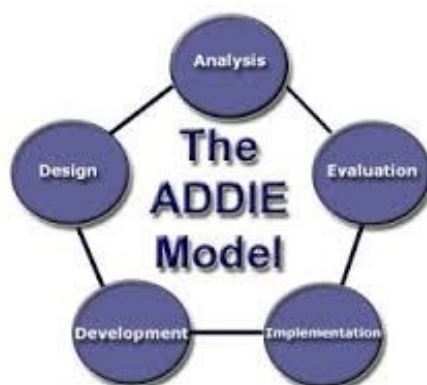
Figure 1. ADDIE Model

This research method is a research and development (Research and Development). Research and development (Research and Development) is a research method used to produce certain products and to test the effectiveness of these products (Sugiyono; 2010.). The research model uses the ADDIE learning design model. This model, as the name implies, consists of five main phases, namely (A) analysis, (D) esign, (D) development, (I) implementation, and (E) valuation. The five phases or stages in the ADDIE model, need to be done systemically and systematically (Sugiyono, 2010). The research procedure that adopts the 5 stages of ADDIE Model development can be seen in Figure 3 below: