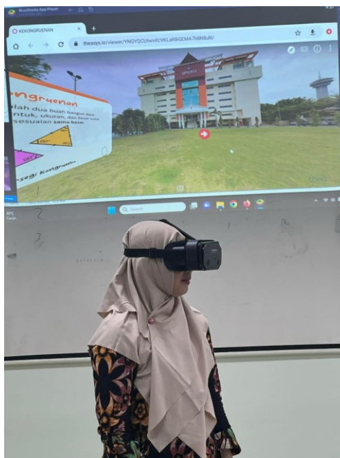
Figure 3. Implementation virtual lab geometry

researchers applied Android-based learning media using a Virtual Laboratory to build flat-sided space materials.